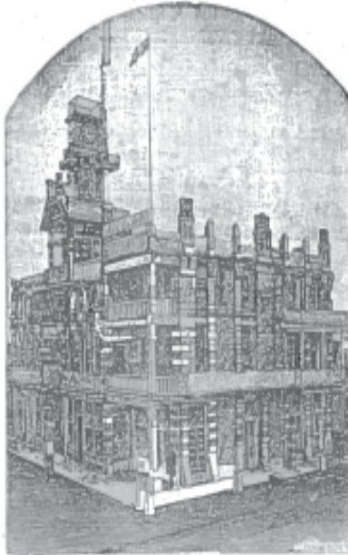
FEATHER BLOCK, SANDY LAKE, PA. If you are sick, go and visit your case to