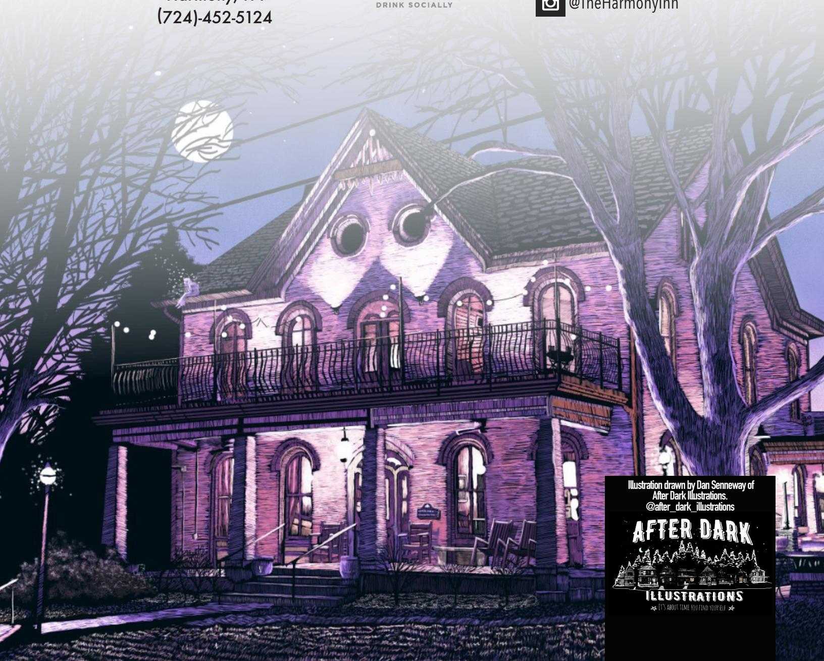
Illustration drawn by Dan Senneway of After Dark Illustrations. @after_dark_illustrations